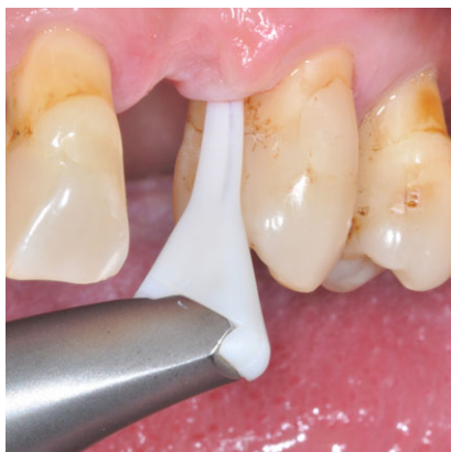
Fig. 2. Subgingival air-polishing in a residual pocket, using a special nozzle (test).

list. At baseline, month 3, 6 and 9, each site with PD >4 mm was treated.